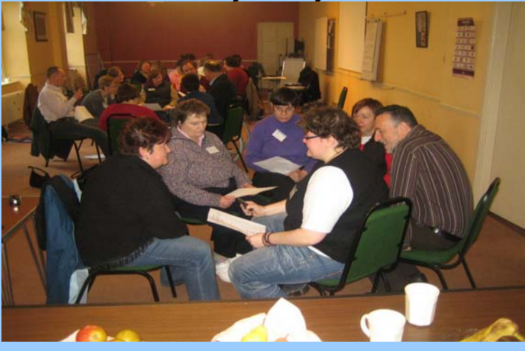
Members of the Inclusive Research Network practice their interviewing skills at a Galway workshop held in November 2008.